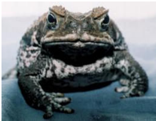
Fig. 1 Adult Cane Toad

In recent months, there has been much publicity about Cane Toad in the country. Seven cases were reported (Tuanaimato, Tuaeufu, Siusega, Pesega, Lotopa, Samoa College, and Matautu), of which a dead toad was brought from Tuanaimato and recently, (30 th of May 2007) a live one was found in the Moata'a, Vaiala, Matautu area.