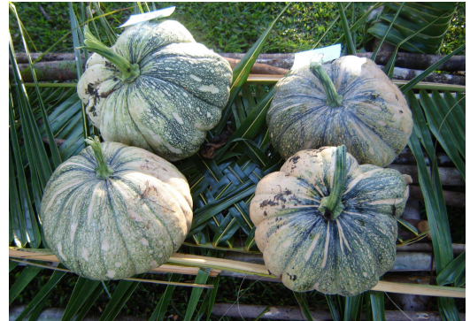
Farmers in Savaii display their produce