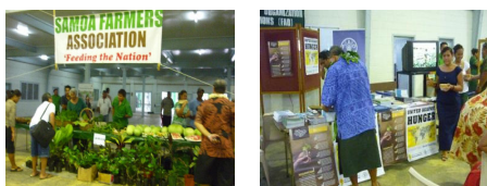
Booths by Quarantine, SFA & SROS

This year marks the 30 th anniversary of the World Food Day. The Ministry of Agriculture and Fisheries together with the rest of the world celebrated this annual event. The theme "United against hunger" recognizes the efforts made in the fight against world hunger at the national, regional and international levels.